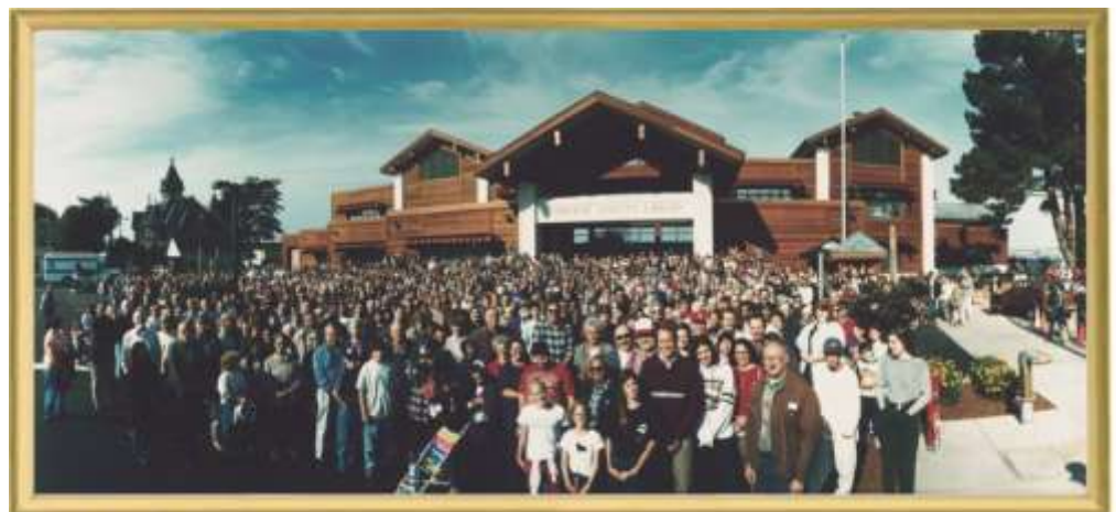
The Library Family The Ribbon Cutting, November 1995

NONPROFIT ORG. US POSTAGE PAID EUREKA, CA 95501 PERMIT NO. 285